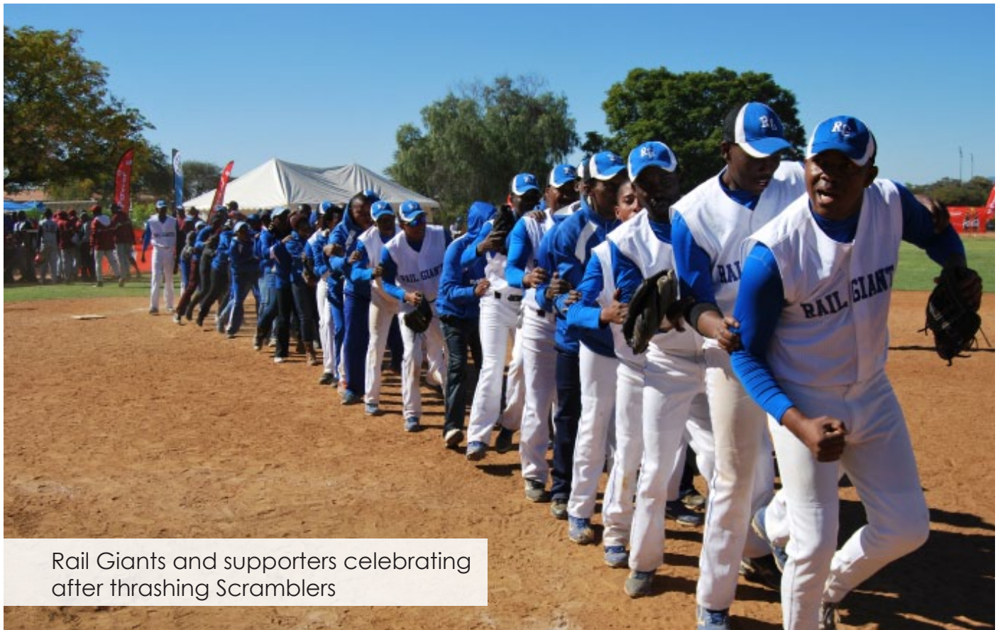
Rail Giants and supporters celebrating after thrashing Scramblers

T he National Diamond stadium was re-opened on the 7th of June 2014 after undergoing renovations for a while. The official opening of the stadium also marked the kick-off of the Vivo Softball national Championships where the top 4 teams in the country battled for supremacy.